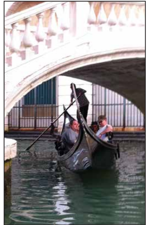
Study Abroad students enjoy a gondola ride.

One of the stops was Mt. Pilatus in Switzerland, some 7,000 feet above sea level. The railroad to the top has been in operation for more than 100 years. While in Italy, students experienced riding in a Gondola along the main canal in Venice. Program organizers are considering a trip to South America for 2015 which would make it the fourth of six inhabitable continents visited since the program was launched in 2000.